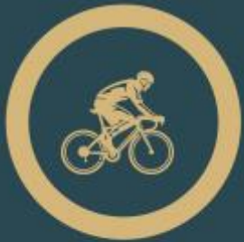
TRACKS FOR CYCLING