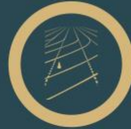
TRACKS FOR RUNNING