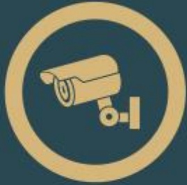
SECURITY SYSTEM CAMERAS, GUARD